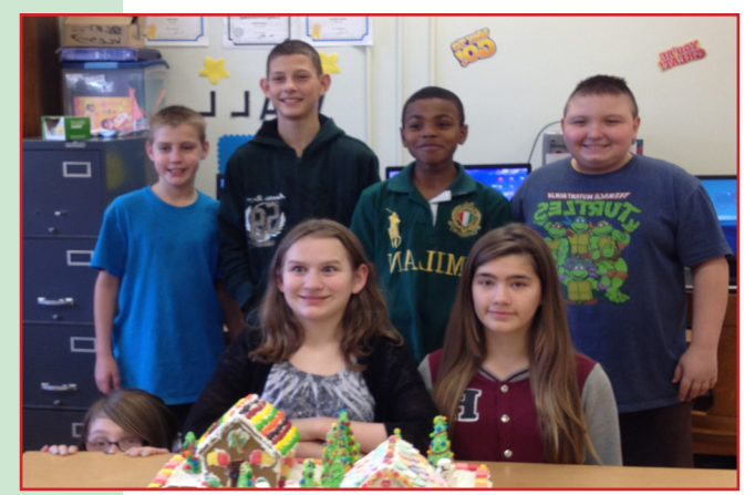
Pictured above: Cedar Street students' gingerbread house creation