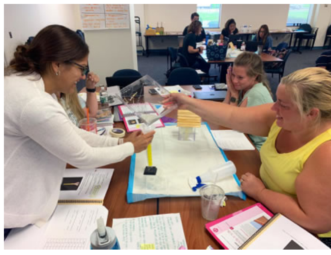
6th Grade: Space Systems Exploration

3rd Grade: How Do Weather and Climate Affect Our Lives?