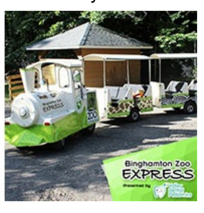
Left: Auto collision students from McEvoy visit the zoo to present the clean, primed, scratch-free train cars (middle). Far right: The zoo added graphics and other embellishments.

More time for free books: A pilot program that has provided free access to e-books for more than 60,000 students has been extended into the school year so teachers can use it as an instructional tool. Our OCM BOCES School Library System began the myOn digital library pilot program in May and, because of its success, decided to extend the program into December. Over the summer, students from 53 districts opened nearly 46,000 books and completed more than 23,500.