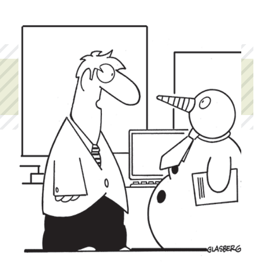
"The rest of us would appreciate it if you would leave the thermostat alone."