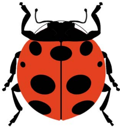
Nine-Spotted Ladybird Beetle (state insect – 1989)