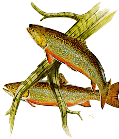
Brook Trout (state freshwater fish – 2006)