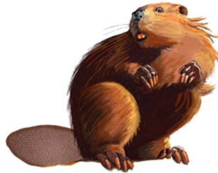
Beaver (state mammal – 1975)