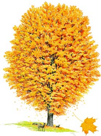
Sugar Maple (state tree – 1956)