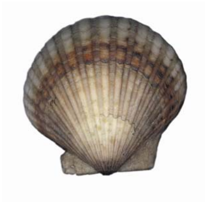
Bay Scallop (state shell – 1988)