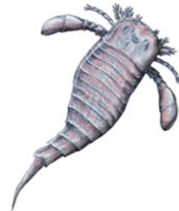
Eurypterid (state fossil – 1984)