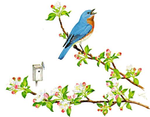
Eastern Bluebird (state bird – 1970)