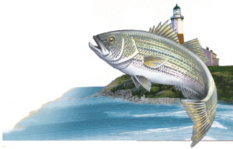
Striped Bass (state saltwater fish – 2006)