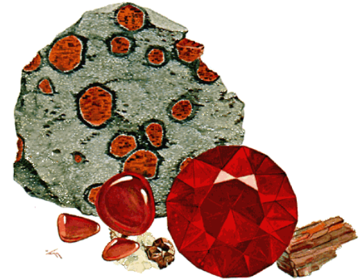
Garnet (state gem – 1969)