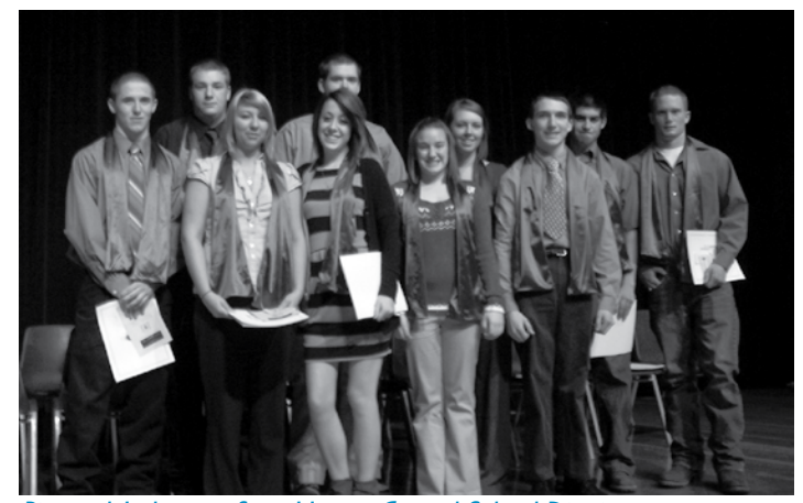
Pictured: Inductees from Homer Central School District